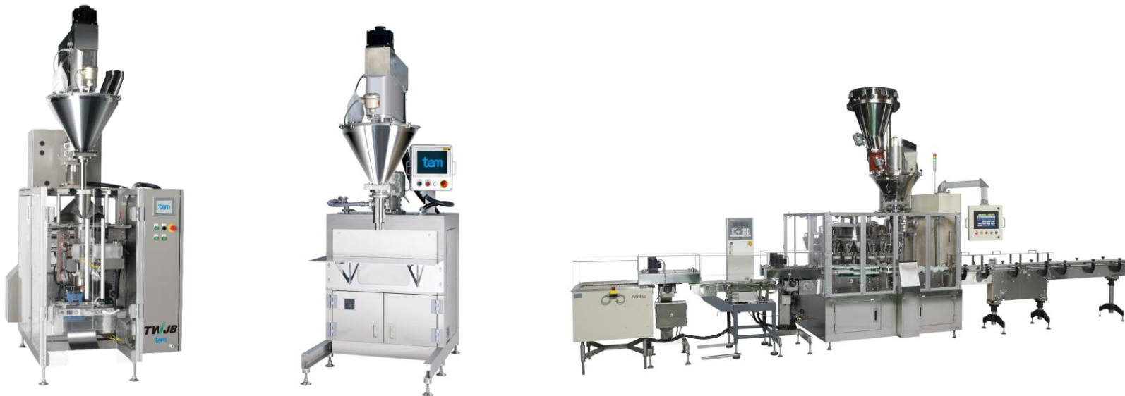
Tam Filling machine

In Tam's auger filler, the products such as flour, seasoning powder or toner powder are handled. Tam filling machine is Volumetric filling type which, an auger screw pushes the powder by rotation of auger while measuring. Combination with VFFS, Pouch packaging machine, capper, labelling machine are possible.