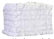
Used paper bale

Our baling machine is used for compressing plastics (such as bottles and bags), non-ferrous metal or used paper (cardboard box, newspaper or magazine) with high density for recycling purpose that would contribute the reduction of transport cost.