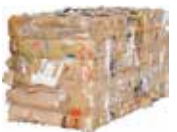
Cardboard case bale